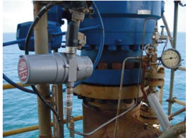
Figure 5. Offshore pipeline leak detection system using Wireless Sensors.

In order to preserve the battery life on the wireless vMBusX-SP sensor (Figure 6), vMonitor modified the firmware on the wireless sensors so it could collect data every 2 secs, buffer the data, but only transmit data every 1 min. This was crucial for the leak detection