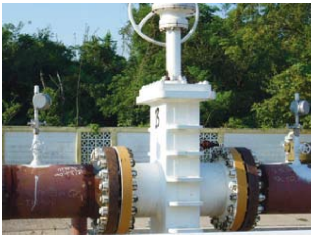
Figure 4. vMonitor Wireless Sensors Installed on Pemex PGPB Pipeline

of approximately 600 km of pipelines (Figure 1).