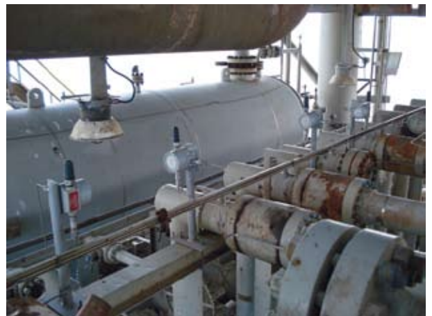
Figure 6. Battery operated vMBusX-SP wireless pressure sensors transmitting pressure data for pipeline leak detection system.

software which required a minimum of 2 secs pressure data. Transmitting data every 2 secs over a range of several kilometers would have drained the battery in a few weeks because the highest power consumption occurred when the radio was transmitting. This allowed the wireless sensor to be almost continuously 'on' to collect data every 2 secs, but only be over the air every two mins.