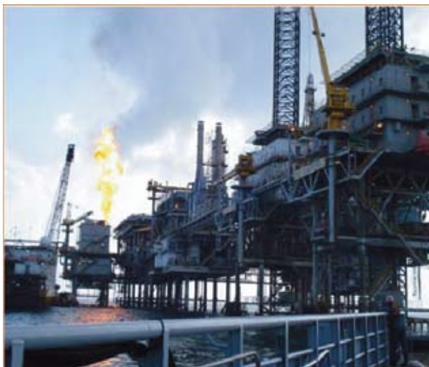
Figure 9. Please supply caption.

vMonitor wireless sensors. The data transfer efficiency of the Wireless System had to be 93 - 96% in order for the LDS Software to claim a high leak detection accuracy. It is important to note that this LDS was designed to detect major leaks in the pipeline. The LDS